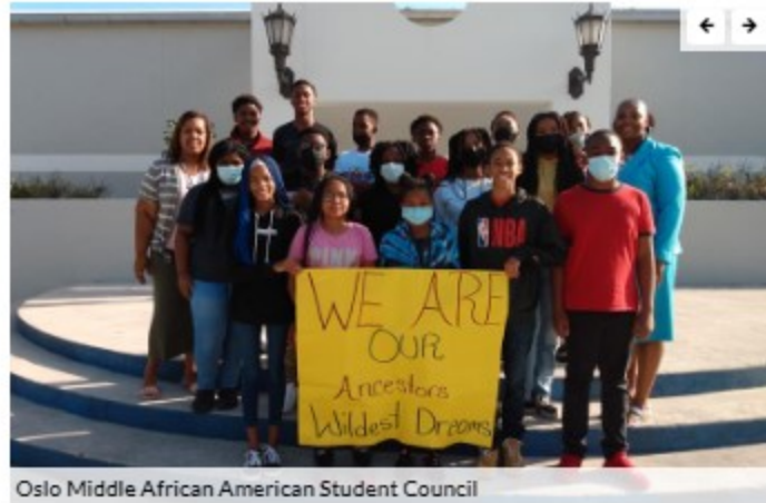
Oslo Middle African American Student Council

The Champions List is an extracurricular guide outlining academic and athletic extracurricular programming available at each school location. The Champions List supports compliance with F.S. 1014.05 (e) Procedures, pursuant to s. 1006.195(1)(a) , for a parent to learn about the nature and purpose of clubs and activities offered at his or her minor child's school, including those that are extracurricular or part of the school curriculum.