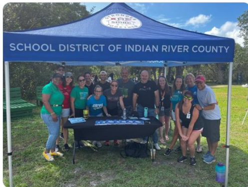
Environmental Learning Center and 9 others

It was another beautiful Saturday for ELC Fun Day! Thank you to our school families who attended and the Environmental Learning Center for opening their doors for family engagement! #SDIRCFamily