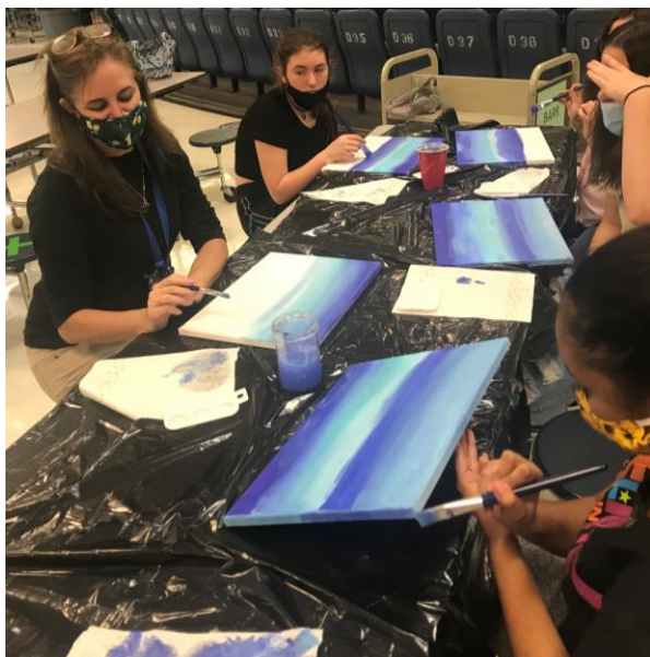
Images from Book/Art Club on Tuesday, 10/20/2020